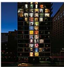
Key Magazine: Post-Bubble New York