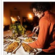
In Rome, the Academy Learns to Cook