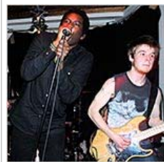
This Band Was Punk Before Punk Was Punk